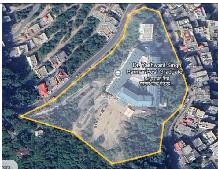
Figure 2: Satellite view of the campus

Satellite view of the campus Geo-tagging Coordinates: 30.5720734,77.2903867