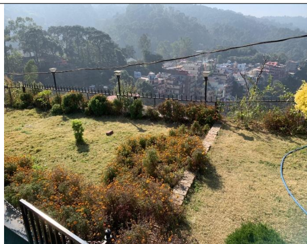
Botanical Graden & Yashwant Vatika