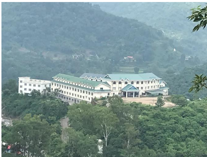
Figure 1: Picture of college campus

Founded in 1963, Dr. Y.S. Parmar Govt. PG College in Nahan is named in honor of Dr. Yashwant Singh Parmar, the first Chief Minister of Himachal Pradesh. This esteemed institution has developed into a symbol of academic excellence and progressive education. In 2017, the college moved to a modernized building, significantly enhancing its facilities and student experience. The achievement of NAAC accreditation in 2021 further affirmed its dedication to high-quality education and continuous improvement.