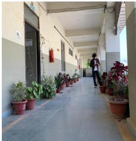
Well-ventilated, naturally lit classrooms with a refreshing green corridor